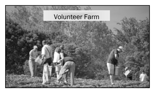
2 Shenandoah Community Foundation