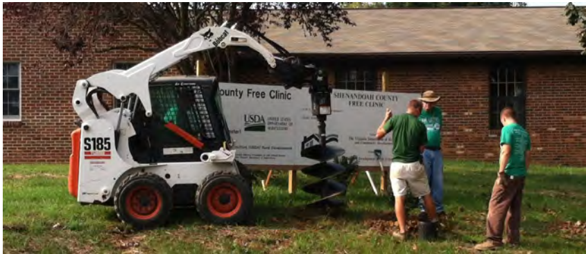
Shenandoah County Free Clinic Volunteers on Day of Caring