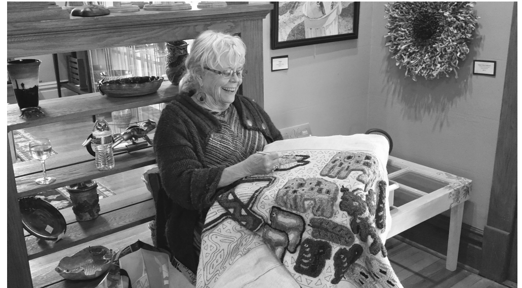
Weaving Demo on the Artisan Trail Supported Through our Unrestricted Grants Program