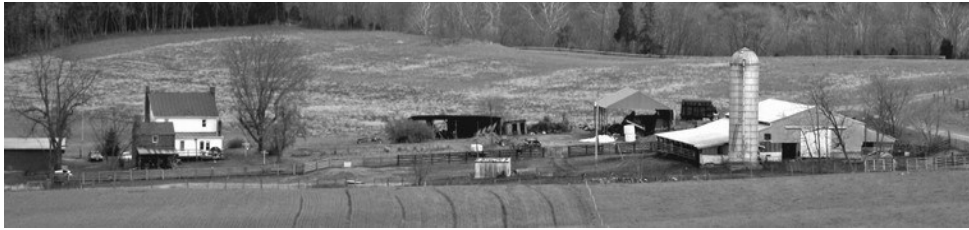
Shenandoah County Farm