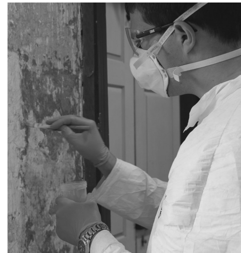
Work on the Shenandoah Historical Society's Graffiti Project