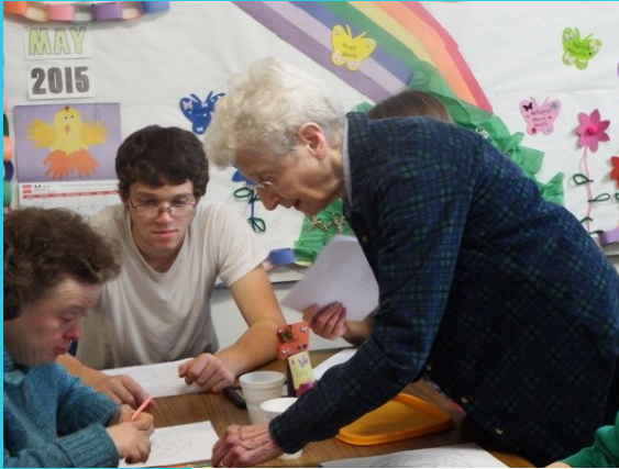
SAAA Our Place Volunteer

The following 2016 grants were made possible through the generosity of Woodstock Anonymous.