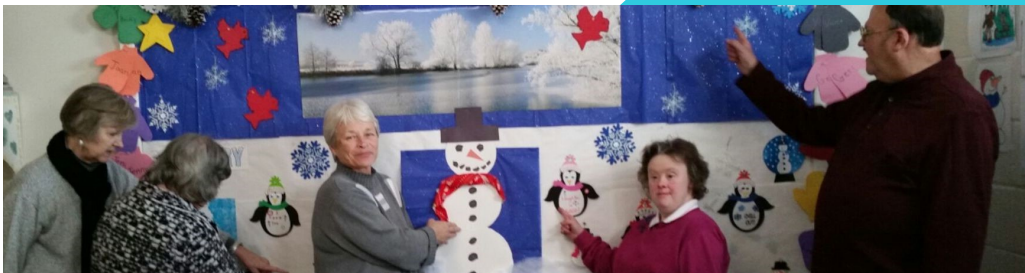
Shenandoah Agency on Aging Our Place Center's Winter Theme Board