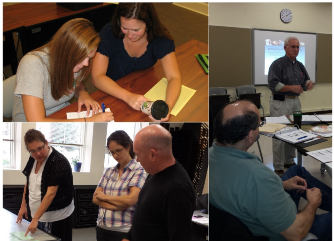
Virginia Cooperative Extension Classes

Shenandoah County Dental Clinic Shenandoah County Lacrosse Shenandoah County Library Shenandoah Education Foundation for the Dolly Parton Imagination Library Shenandoah Valley Lutheran Ministries Luke's Backpack Program Shenandoah Valley Music Festival Shen-Paco Industries, Inc. Spring Forward Theatre Shenandoah Valley Health Shenandoah Memorial Hospital Foundation Virginia Cooperative Extension