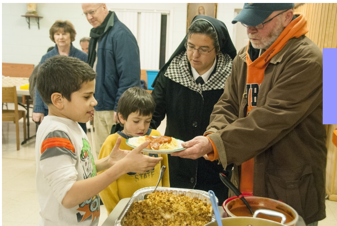
Family Promise received funding from the Community Grants Program (left)