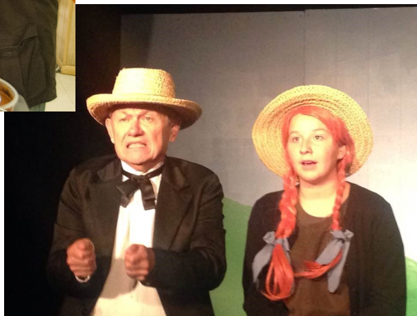
Photo from Shultz Theatre's Production of Anne of Green Gables funded by the Community Grants Program (right)