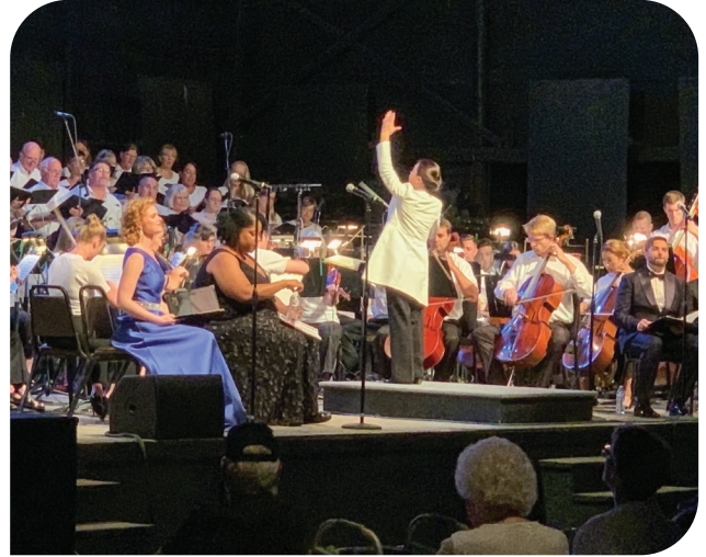
The Richmond Symphony performed Beethoven's Symphony No. 9 at the Shenandoah Valley Music Festival.

A unique aspect of the Bowman-Shannon fund is that at least half of the annual awards in a given year are required to be granted to public schools in the County. This has presented extraordinary opportunities for students in our schools, particularly as the arts typically receive low priority funding. Among the school awards in 2022, a unique grant was awarded to Massanutten Regional Governor's School to use art to communicate scientific information to various audiences. Funding for this project covered the costs of materials and a public showcase of the work of more than 40 students.