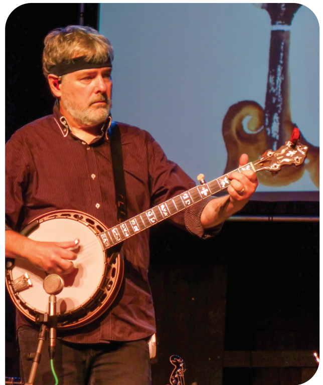
Béla Fleck delighted the audiences at Shenandoah Valley Music Festival, both on stage and at a workshop for banjo aficionados.