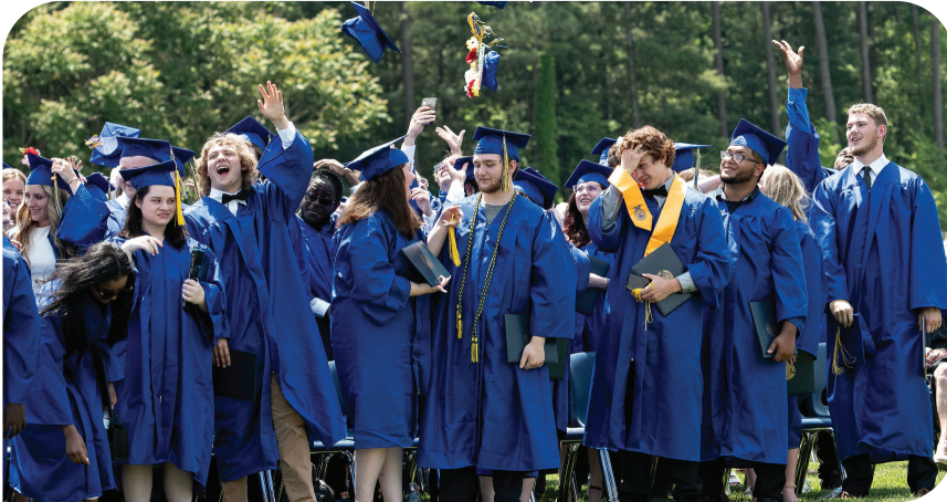
2022 Central High School graduates