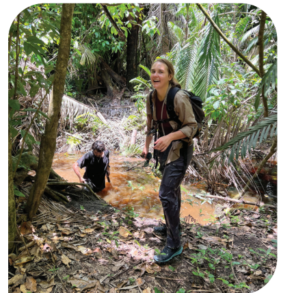
Wading through deep water to get to a camera station