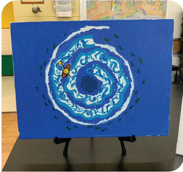
Massanutten Regional Governor's School students used art to convey scientific concepts and information.