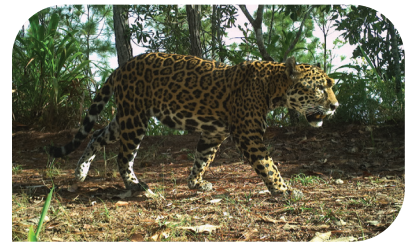
A jaguar caught on camera