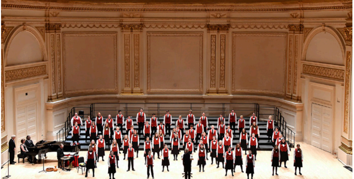
Four Shenandoah County youth performed at Carnegie Hall on July 7, 2023, with the Shenandoah Valley Children's Choir.