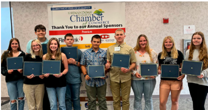
2023 graduates of Student Leadership Shenandoah County, a program of the Shenandoah County Chamber of Commerce that fosters the development of student leadership skills through various experiences