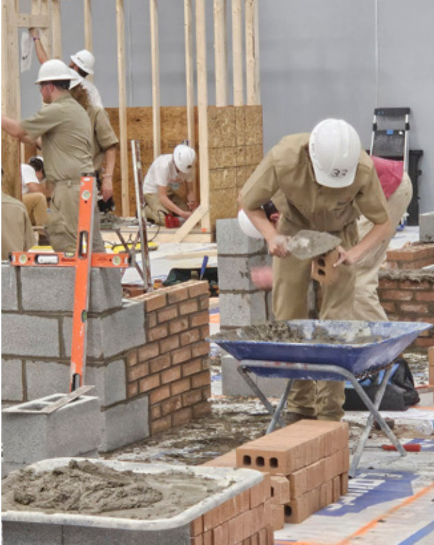
Triplett's Masonry program prepares students for entry into an apprenticeship program in the Masonry field. Other construction programs include Carpentry, Electricity, and HVAC.