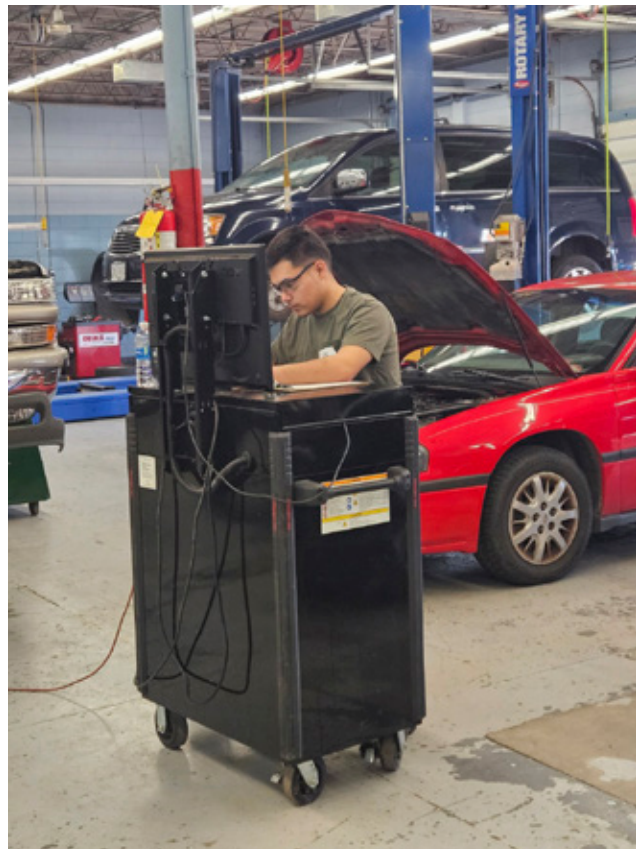
Automotive Studies is one of 18 programs currently offered at Triplett Tech.