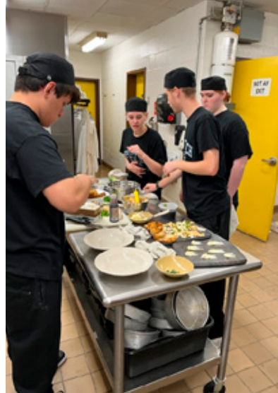
Culinary Arts is a popular program at Triplett Tech, intended to prepare students for a rewarding career in the food service industry.

CTE programs play a crucial role in preparing students for a wide range of high-skill and high-demand jobs. There is an obvious benefit for students and employers; however, the entire community also benefits as job growth helps sustain the economy of Shenandoah County. As the projected deficit of a skilled workforce grows to 6.5 million workers in the U.S., CTE is increasingly viewed as a primary solution.