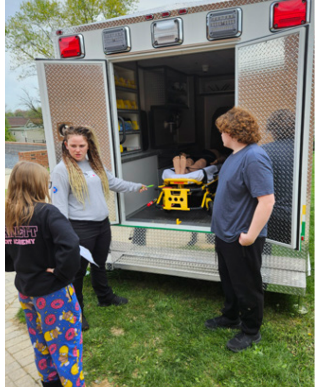
The Emergency Medical Technician (EMT) program prepares students to provide prehospital assessment and care for patients of all ages with a variety of medical conditions and traumatic injuries.