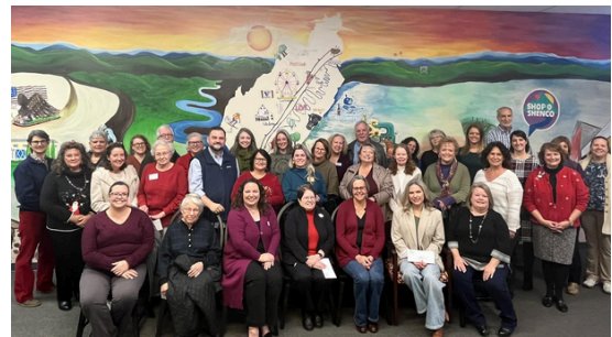
2024 Giving Tuesday check presentation.

Shenandoah County SEARCH, Inc Shenandoah Education Foundation Shenandoah Valley Lutheran Ministries Shenandoah Valley Music Festival Shen-Paco Industries, Inc. Sustainability Matters Theatre Shenandoah