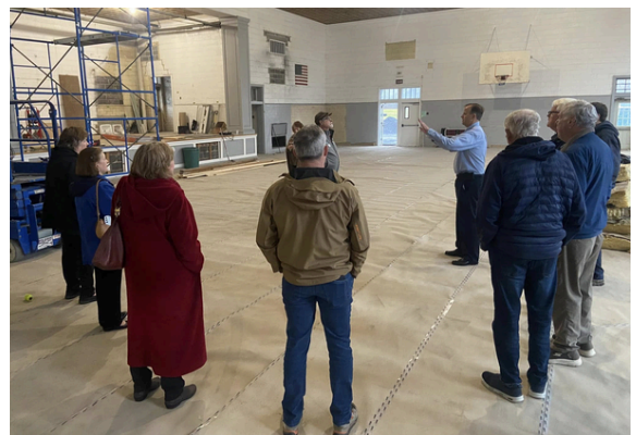
SCF Board of Directors tours the CREW Community Center and hears about the renovation progress.

In 2024 the Shenandoah County Public Schools received $150,000 to upgrade and install advanced sound systems in all three high schools to support a range of activities, including musical performances, theater productions, assemblies, and other school events. Community Resources for Education and Wellness (CREW) received $50,000 to help renovate the performing arts center in the former Triplett School in Mount Jackson. Both of these projects will support the mission of the Bowman-Shannon Cultural Arts Fund and allow many individuals, of all ages, throughout the county to experience the cultural arts.